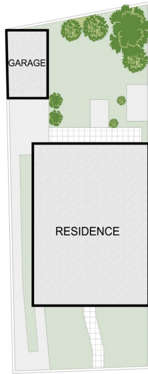
SITE PLAN Approx 12.2m Frontage